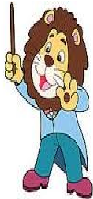
Conducting Course 2