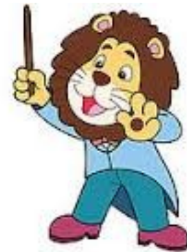
Beginning Conducting Course